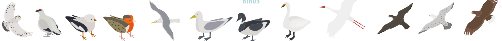
SNOWY OWL WILLOW PTARMIGAN SNOW BUNTING RED-THROATED PIPIT GLAUCOUS GULL BLACK-LEGGED KITTIAWAKE LOON TUNDRA SWAN SIBERIAN CRANE white snow crane PEREGRINE FALCON duck hawk GYRFALCON gyrfalcon WHITE-TAILED EAGLE Eurasian grey sea eagle