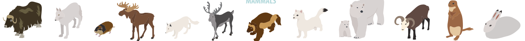
MUSKOX ALASKAN TUNDRA WOLF barren-ground wolf LEMMING ELK moose ARCTIC FOX POLAR (SNOW) FOX REINDEER (CARIBOU) WOLVERINE skunk bear, glutton, carcajou STOAT short-tailed weasel POLAR BEAR SNOW SHEEP Siberian bighorn sheep ARCTIC GROUND SQUIRREL TUNDRA HARE mountain hare, snow hare